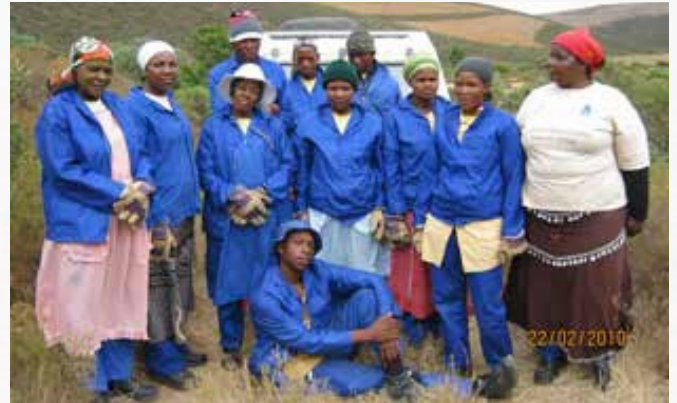
Table Mountain Fund (TMF), a subsidiary of WWF-SA, contracted NCC in 2010 to run a pilot project using CSI corporate funding from Pioneer Foods Fund to uplift communities in the Boland.

NCC managed the project which included the preparation of firebreaks, pre-planned burning, alien vegetation management, erosion control, footpath building and road maintenance.